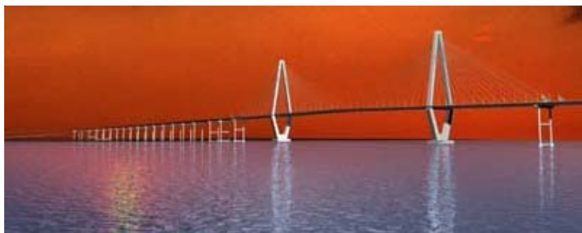
Fig. 1 Rendering of Cooper River Bridge

Based on the test results, designers used a reduction factor of 70% to account for the reduced lateral resistance. The diameter for the bridge foundations was eventually increased to 10 ft. Rollins was awarded a $105,000 grant from the National Science Foundation to conduct a detailed analysis of the test results. Based on these studies, “p-y curves” are being developed to define the load-displacement relationship of liquefied sand. These results have been combined with those from Treasure Island to account for the effect of pile diameter.