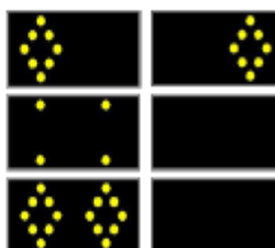
Flashing sequence of arrow-panel caution displays for work zones

Opinion survey questions showed that motorists strongly considered either diamond display better than the "Flashing Box" at prompting safe driving near highway work. The second study, conducted from May 2002 to June 2003 with Jeanne M. Bowie, evaluated the efficacy speed monitoring display (SMD) in increasing work zone speed limit compliance. For the field study, three main conditions were analyzed: a no-treatment case, with the MUTCD signs and barriers; a treatment case using the SMD; and a treatment case using a police vehicle. In the no-treatment case, average vehicle speed was reduced about 3 mph as vehicles entered the work area of the work zone. With the SMD, average vehicle speed was reduced 7 mph. With the police vehicle, average vehicle speed was reduced about 9 mph. (These conclusions are valid at a 95% confidence level.) The results of the study suggest that the SMD is a promising option for state DOTs. Police presence has been reported by many studies as the most effective speed limit enforcement in work zones but it has been recognized as the most expensive method. This study indicated that SMDs could be a cost-effective alternative to police presence for encouraging the drivers to comply with work zone speed limits.