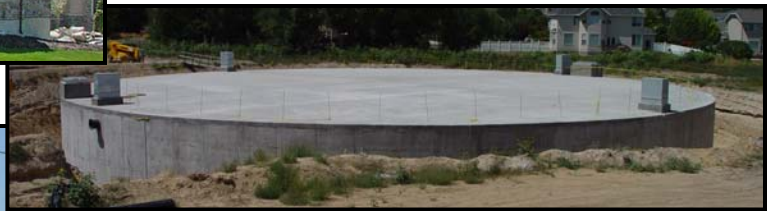
South Jordan Zone 1B Reservoir: 4.0 Million Gallon