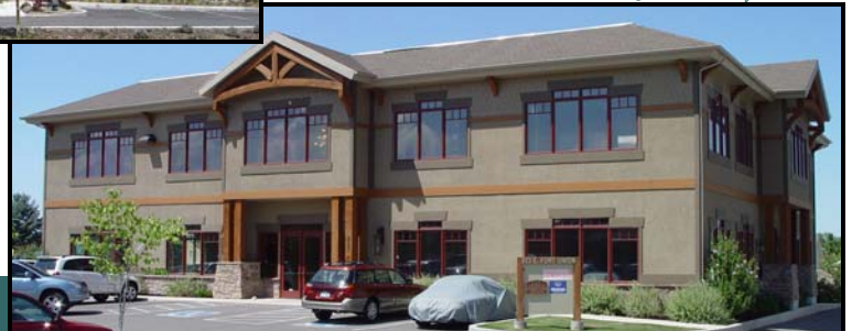
613 Fort Union Office Building: 19020 square feet