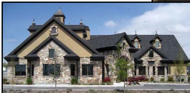
Lewis Dental Office: 9230 square feet