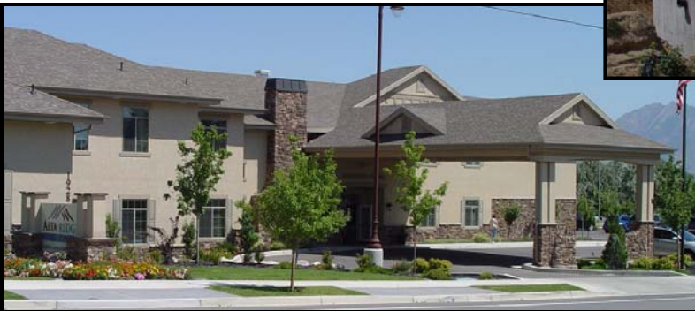
Alta Ridge Alzheimer's and Assisted Living Center: 65160 square feet