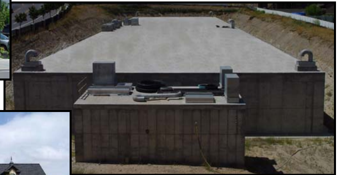
South Jordan Zone 2 Reservoir: 7.5 Million Gallon