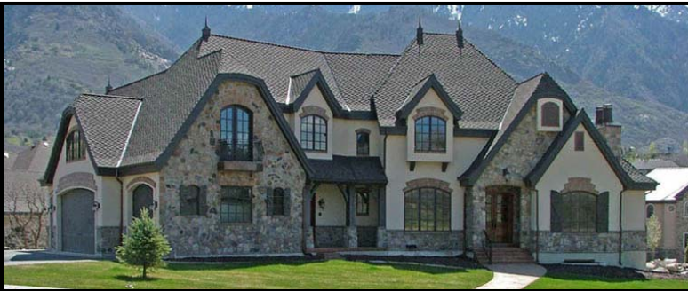
Lot 1084 Pepperwood: 8235 square feet

timber. The firm's experience also includes the investigation, evaluation, and presentation of reports for all types of problems that have legal implications which require an expert witness. Our clients depend on us to provide quality work from a project's conceptualization through its implementation.